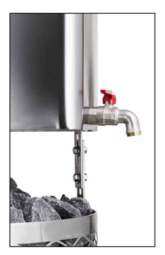
2. Affix the water heater on to the stove's mesh frame using the metal support bracket that is included in the delivery.